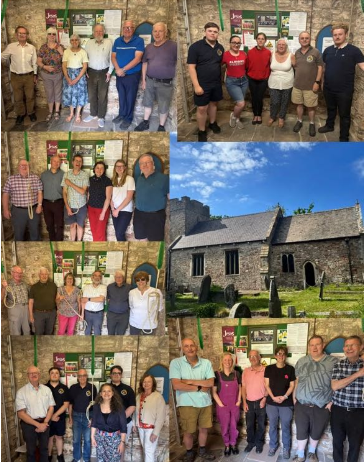
Sully Striking competition Newsletter of the Llandaff Branch of the L&M DACBR